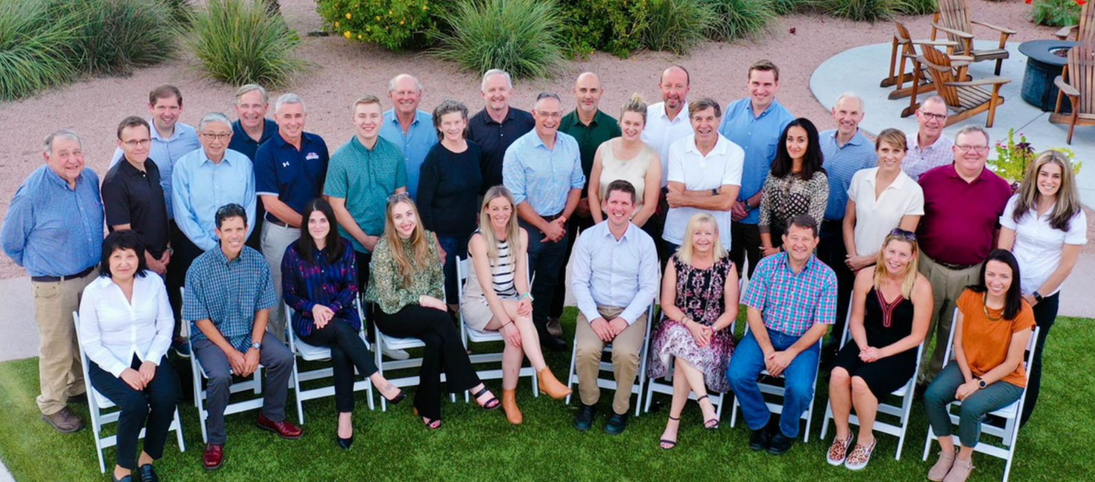
PARTICIPATION AT THE USADA SYMPOSIUM, OCTOBER, 2021