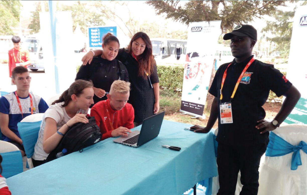
Athletes participating in the IAAF World U18 Championships undertake anti-doping quizzes at the ADAK / WADA stand which was stationed at the Athletes' Village in Kenyatta University