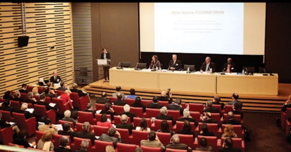
France Minister for Sport, Ms Valérie Fourneyron, addresses the Conference

Other means of contributing to the anti-doping cause – such as a framework for future cooperation between WADA and the health sector, and possible funding for relevant anti-doping research – were also discussed.