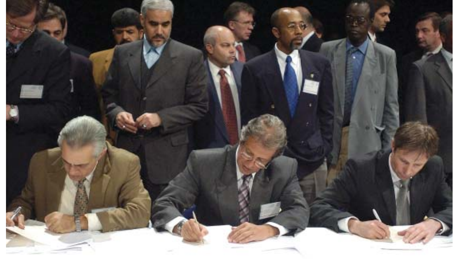
Government representatives to the World Conference sign the Copenhagen Declaration.