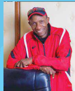
Mr. Douglas Wakiihuri Member