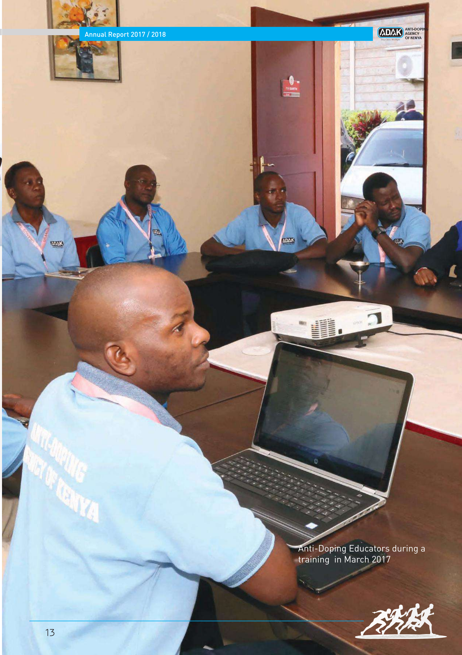
Anti-Doping Educators during a training in March 2017