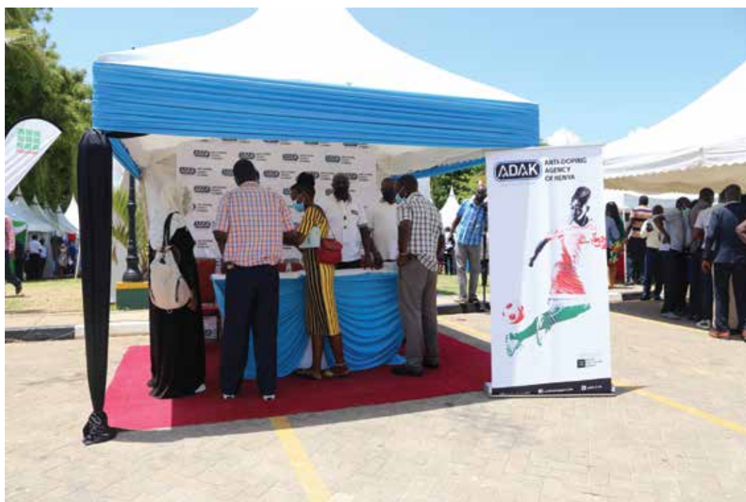
ADAK anti-doping educators pitch tent at the 21st edition of the Kenya Clinical Officers Association (KCOA) annual conference. ADK seeks to have a high number of medical professionals getting involved in the eradication of doping in sport.