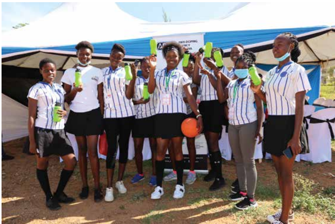
Participants pose with their freebies that they received from the ADAK anti-doping education team after taking part in an anti-doping education quiz during an outreach session at Kibabii University.